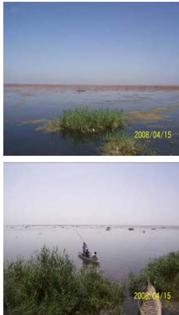
Figure 2. Photographs of two of Huweza Marsh Stations