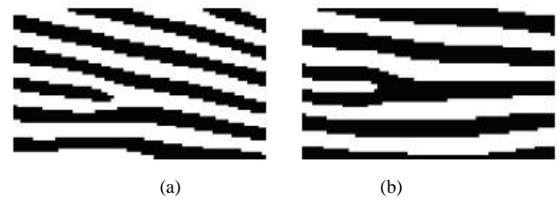
Figure 1. Minutiae Points. (a) Ridge ending (b) Bifurcation

fingerprint. Ultimately, the minutiae are relatively regular and sturdy to contrast, and image has a good resolution.