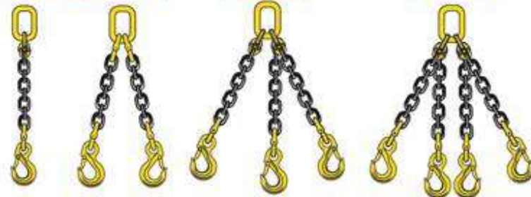
4 LEG SLING