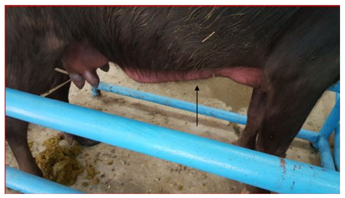
Figure 2. Edematous fluid (Arrow) was extended to the belly of the diseased buffalo.