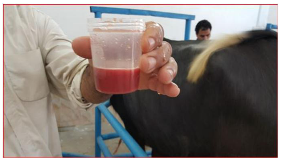
Figure 3. Milk of the diseased buffalo is watery in its consistency with light red or deep pink color

Table 1. The Systemic (vital) signs of the diseased buffalo