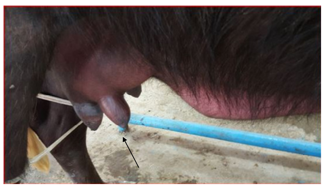
Figure 1. Diseased udder of buffalo show acute inflammation with redness and swelling, with coldness, blue black coloration, on one quarter (Arrow)