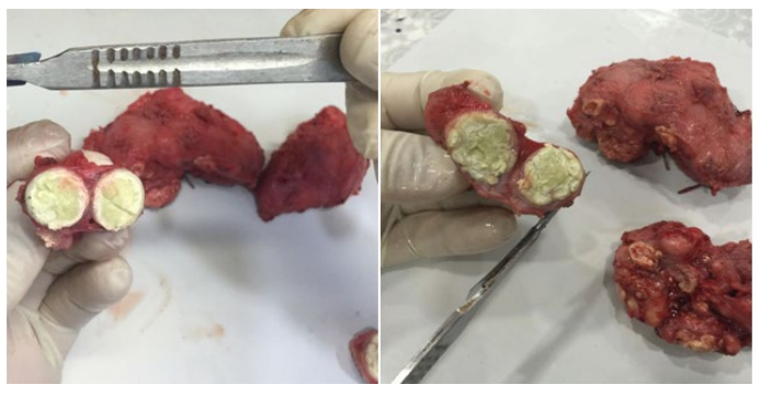
Figure 2: Cross-section of retropharyngeal lymph node of Awasi ram infected with Pseudomonas aeruginosa showing abscesses in the medulla and cortex of the node.