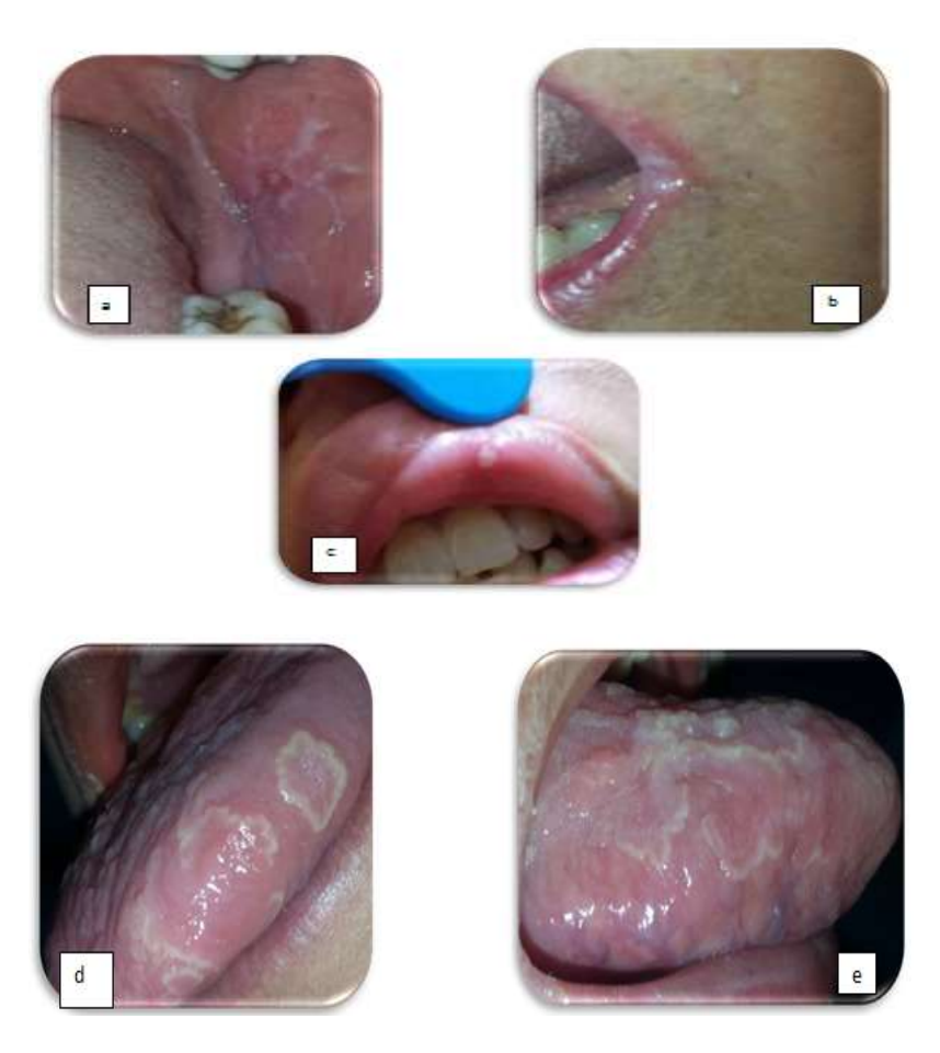
Figure (1): Some of the Oral Findings in RA patients, a: Lichenoid reaction b: Angular chelitis c: Apthous ulceration d&e: Geographic tongue.

In the group of combination, 16(53.3%) of them had dry mouth, 10(33.3%) patients had TMJ disorders, 2(6.6%) patients were having aphthous ulcerations and one patient(3.3) had glossitis. Only in this group one case (3.3%) with lichenoid drug reaction (figure 3-1a), one case (3.3%) of the angular chelitis (figure 3-1b) and one case(3.3%) of geographic tongue(figure 3-1d&e) were found.