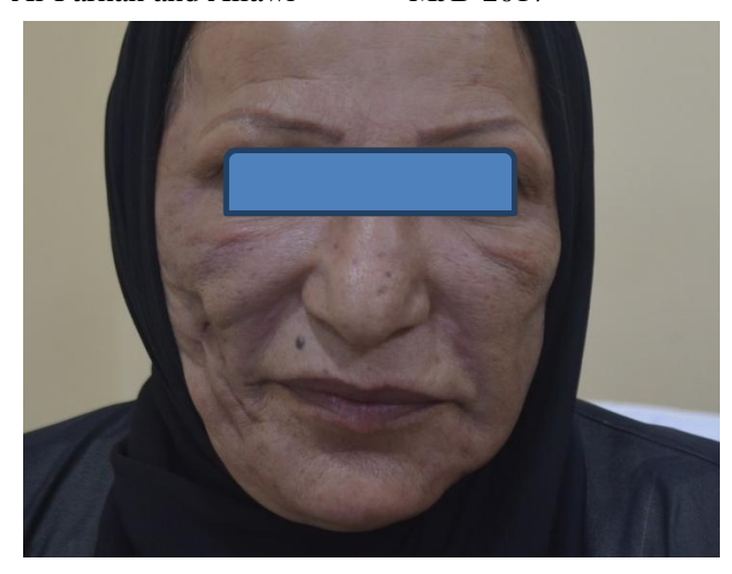
Figure 3: Patient with severe deformity after removal of PAAG from the check.

In group IV, six patients (14.2 %) were suffering from hard masses in their cheeks that lead them to feel unnatural texture. In addition these masses appeared to be descended downward in their cheeks and making unnatural Jowls. Trail to aspirate