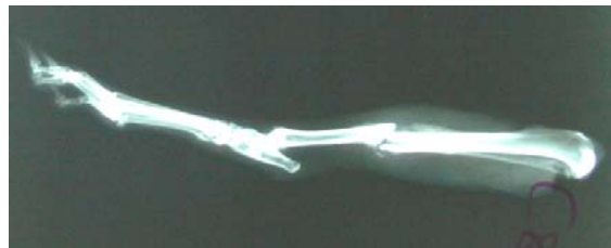
Fig. 1: Radiological findings of fracture healing (grade 1).

Radiographs of the leg were done on the day of the procedure and then repeated after 4 weeks. Fracture healing evaluated blindly by radiologist according to a 5 point scale describing the degree of callus density (degree of mineralization) and the degree of fracture line visibility 14 as in Figures 1-3, and table I.