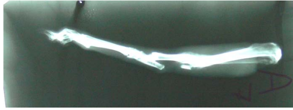
Fig. 2: Radiological findings of fracture healing (grade 2).