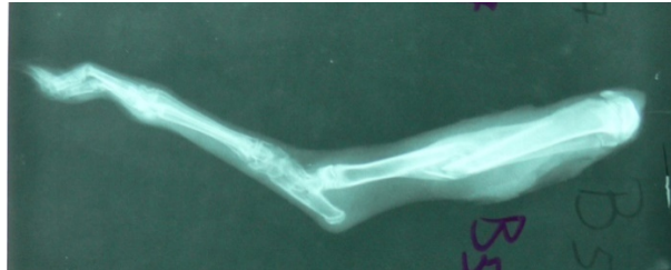
Fig. 3: Radiological findings of fracture healing (grade 3).