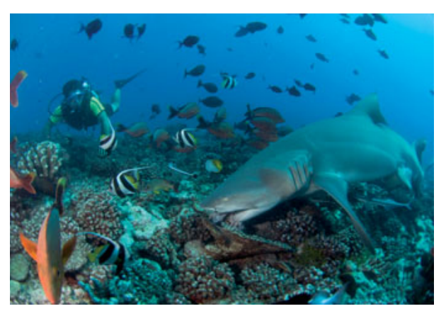
Figure 2. Lemon shark (2.8 m) searching for food hidden in the coral under the watchful eye of a diver.