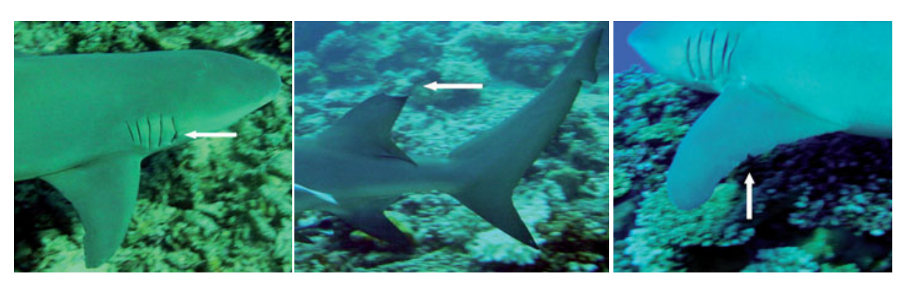
Figure 3. Distinctive marks are used to identify individual sharks: scar on the right-hand gills (a), severed apex on the second dorsal fin (b) and notches in the left-hand pectoral fin (c).

Because the lemon shark's skin is an even yellowishbeige, the idea was to first sort the animals by sex and overall size, and then compile distinguishing traits for each individual, using scars or notches and slits in the fins or other spots (Fig. 3). As a result of the study, each shark could be identified individually, which was the first step towards observing their behaviour with regard to feeding over a period of months or even years, as was the case from 2006–2010. As well as observing sharks, Buray carried out underwater biopsies for genetic testing (see Box 2 on p. 44).