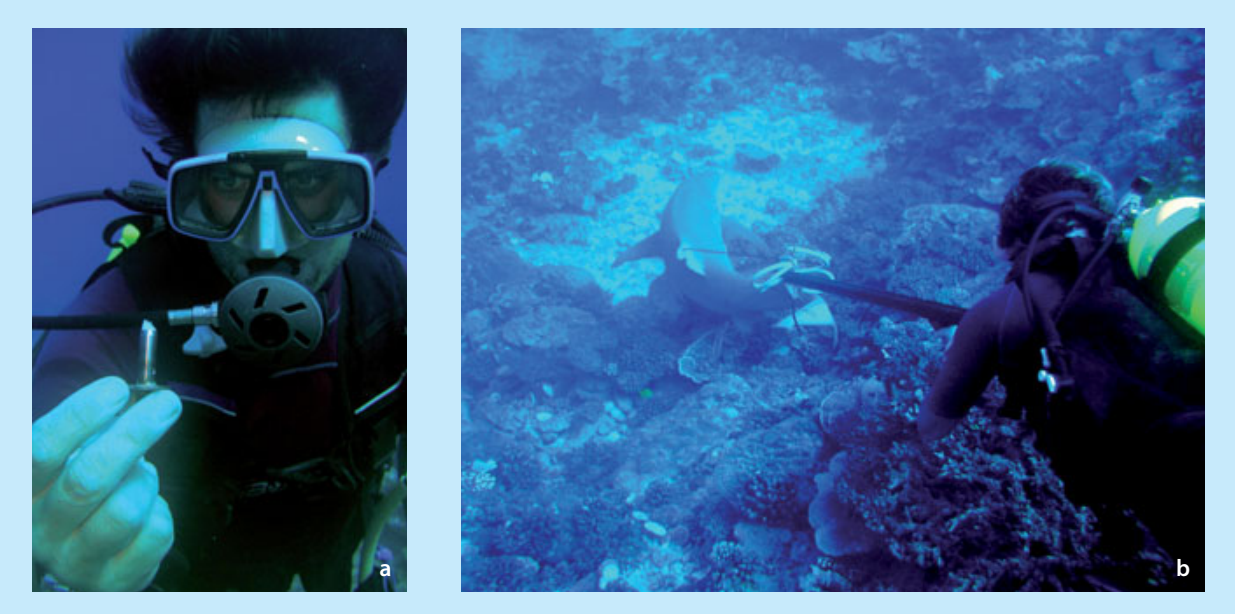
Figure 5. a: Scientific diver displaying a punch containing a piece of flesh following a biopsy; b: Scientific diver shooting at lemon shark's dorsal fin for a biopsy.

Biopsies consist of sampling a piece of skin (sometimes with fat and muscle) for genetic testing. On Moorea, such tests assessed the degree of kinship between two individual sharks over one or two generations. The tests were carried out using an underwater crossbow and arrow with a puncher at the tip, usually used for whale biopsies. The punch is made up of a hollow tube with a sharp rim and round stop preventing the shark from being pierced to depths of more than 2 or 3 cm. Inside it, barbs hold the flesh in as the arrow is expelled and bounces off the shark (Fig. 5a). The arrow is usually shot at the fin's base so it can cross it and take a core sample, increasing the chances of obtaining a piece of skin (Fig 5b). The sampling is painless for a shark that suffers far more violent attacks from other sharks, but it is often very surprised and sometimes reacts by turning on the shooter. Needless to say, such situations become fairly unpleasant.