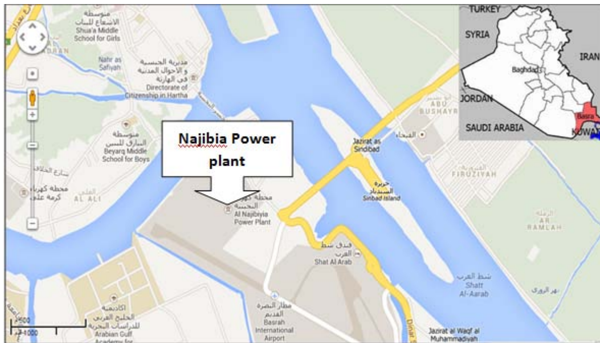
figure 3: a map showing Najibia Power Plant location.

located at Basrah governorate as shown in figure 3.