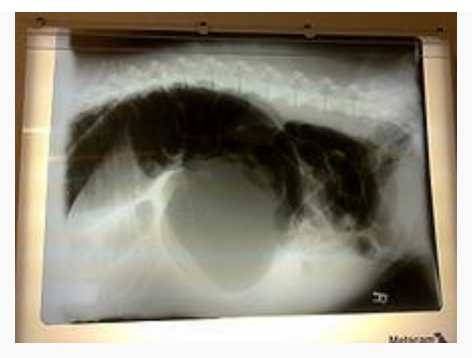
X-ray from the side of a dog with severe intestinal gastric dilatation-volvulus.

It is always advisable to seek veterinary advice before attempting any procedures at home as these may further worsen the animal's condition.<sup>[21]</sup>